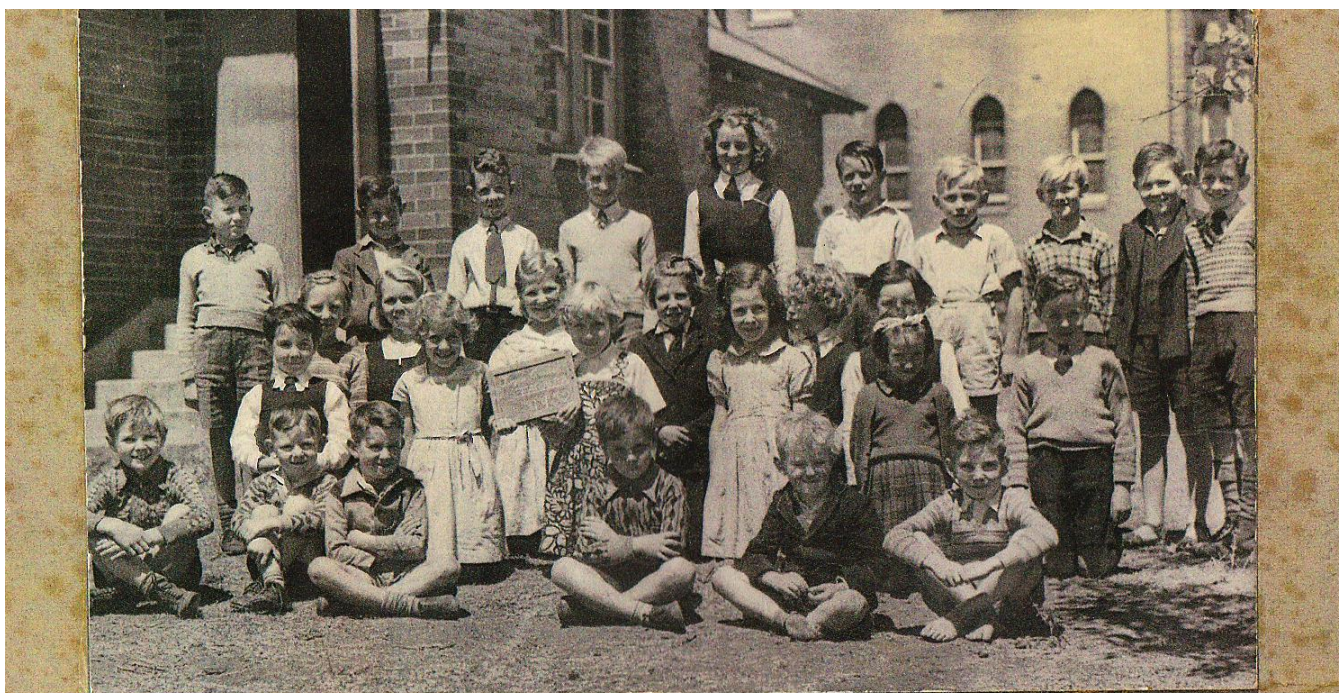
SACRED HEART SCHOOL TARALGA JUNIOR GRADE 1952