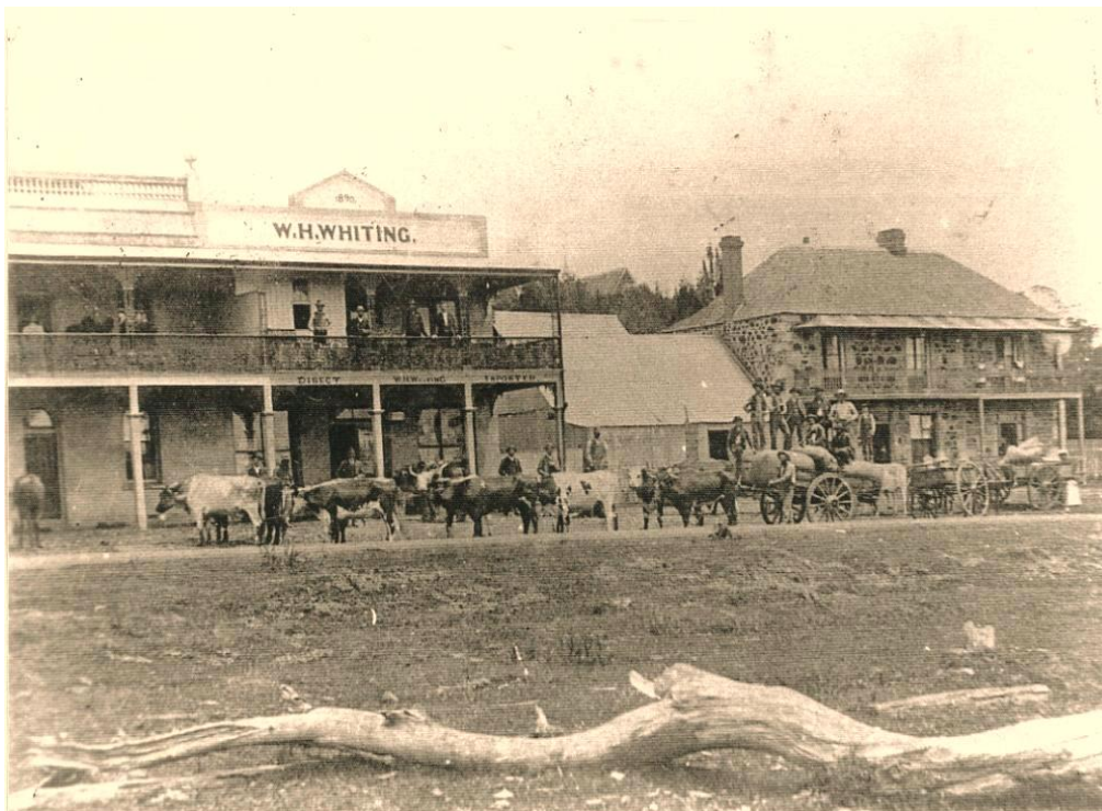
Building between the 2 Whiting buildings was a Chemist dispensary.